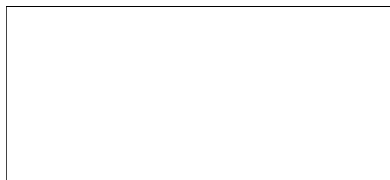
Figure 1 Figure caption

If figures are inserted into the main text, type figure captions below the figure. In addition, submit each figure individually as a separate file. Figures should be provided in a file format and resolution suitable for reproduction, e.g., EPS, JPEG or TIFF formats, without retouching. Photographs, charts and diagrams should be referred to as "Figure(s)" and should be numbered consecutively in the order to which they are referred